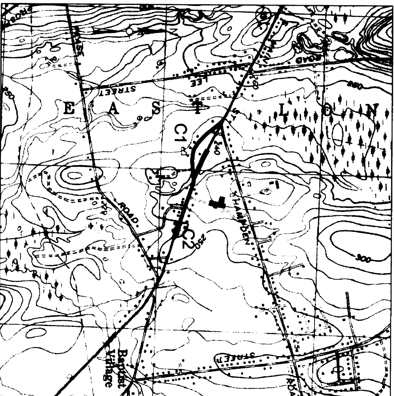
LOCATION MAP SCALE: 1"=100'

SHEET NO. TITLE G-1 ABBREVIATIONS, NOTES, AND LEGEND C-1 SOUTH BEND ROAD - STATION 0+00 TO 14+80 C-1 SOMERS ROAD - STATION 0+00 TO 7+65 C-2 SOMERS ROAD - STATION 7+65 TO 11+47 C-3 DETAILS